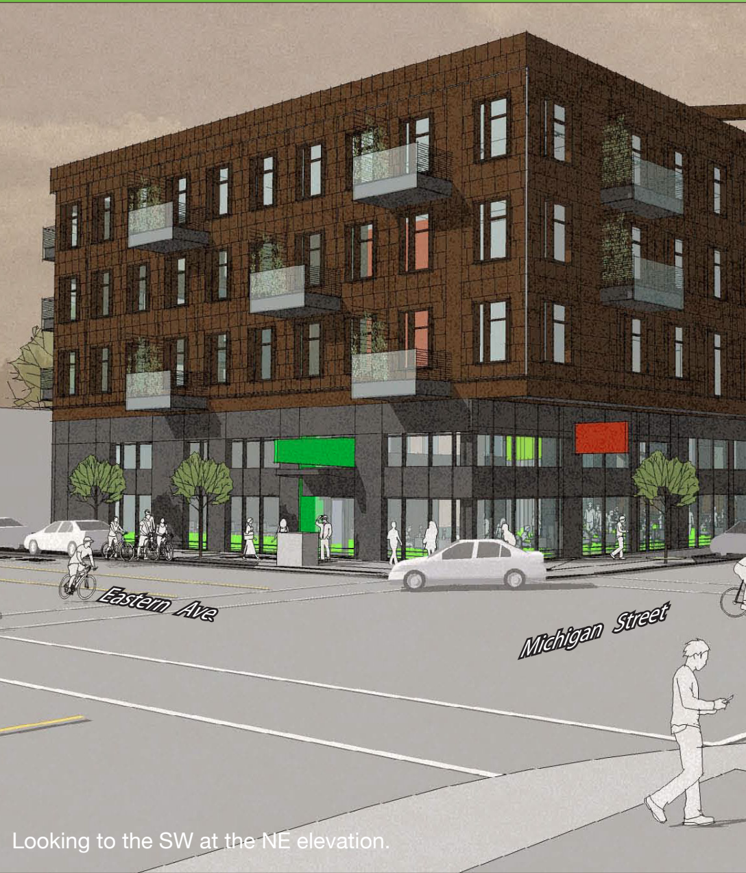
Looking to the SW at the NE elevation.

New restaurant & retail suites in Midtown just blocks from the Michigan Street "Medical Mile".